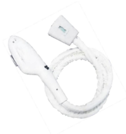
E-Light Filter (IPL+RF with 5 Filters - 8x40mm)