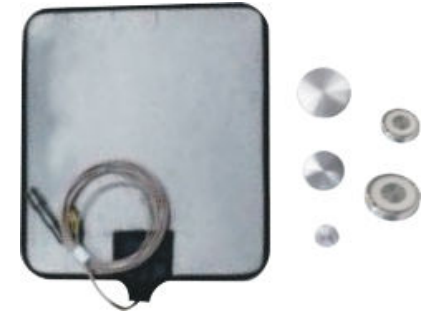
Mono-polar & Bi-polar RF Accessories

IPL with RF allows you to do treatments on Fine, Lighter Hairs. The Energy levels don't have as high as a normal IPL so the treatments are a lot safer and more comfortable.