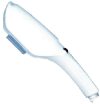
E-Light (IPL+RF - 15x60mm)