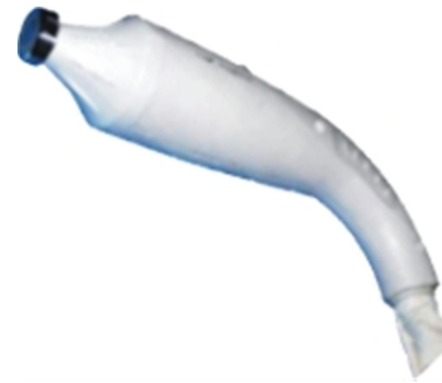
Mono-polar & Bi-polar Radio Frequency